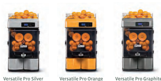
Versatile Pro Silver

The Versatile Pro is a must in places where there is demand for juice. Its feeder is integrated and allows the machine to be completely autonomous and more efficient. Thanks to an intuitive digital display, you can configure the operation mode to suit your working style.